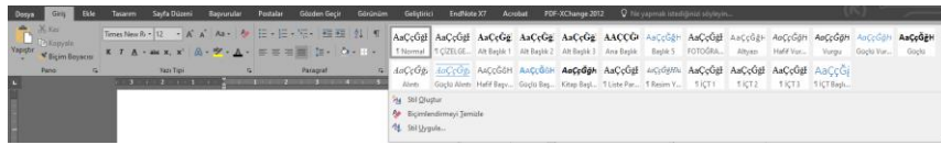
Figure 1.2. Selecting text styles

All mathematical and chemical formulas, equations, and expressions should be written clearly and neatly. Equations are numbered sequentially within their respective sections. These numbers are written on the far right of the line in the format [(1.1), (1.2), ..., (2.1), (2.2), ...], and if necessary, sub-expressions of the same equation are labeled as (1.1a), (1.1b).