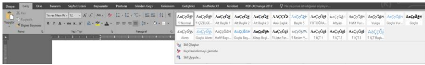
Figure 1.2. Selecting text styles

All mathematical and chemical formulas, equations, and expressions should be written clearly and neatly. Equations are numbered sequentially within their respective sections. These numbers are written on the far right of the line in the format [(1.1), (1.2), ..., (2.1), (2.2), ...], and if necessary, sub-expressions of the same equation are labeled as (1.1a), (1.1b).